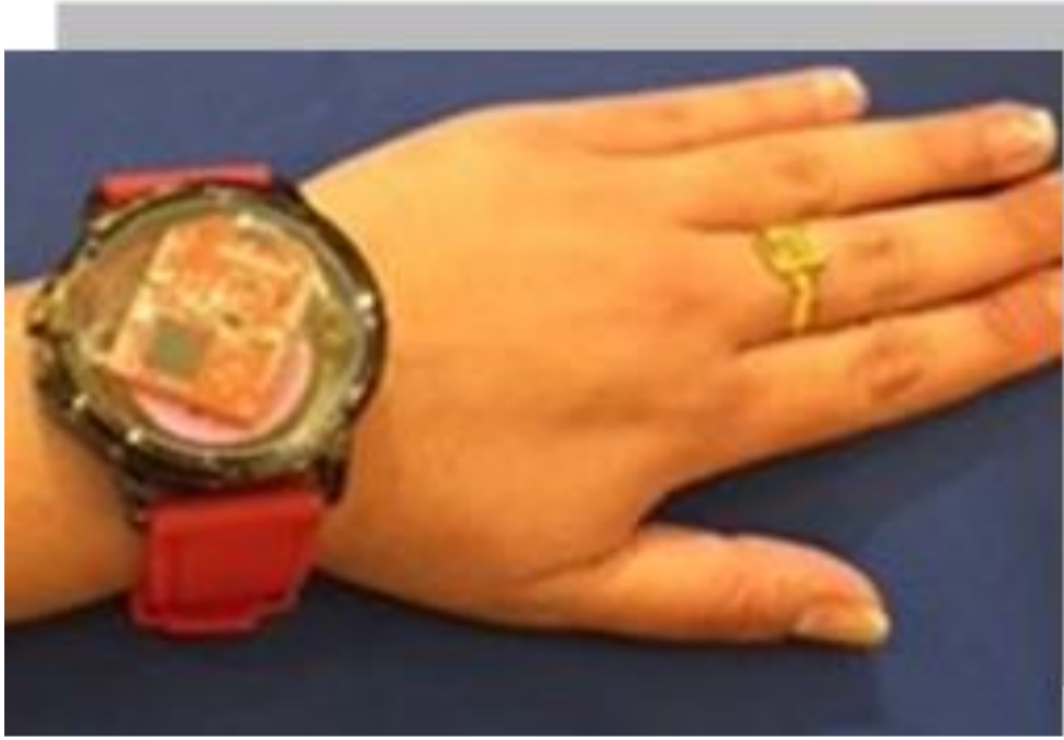
12-Month Battery Life

mistBit™ provides an immediate alert message via a double-tap. Temperature can also be monitored.